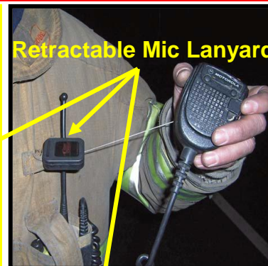
Retractable Mic Lanyard

A retractable mic lanyard can also be used if you carry your radio in a radio pocket. The lanyard can be attached to the radio clip to allow the mic to be raised up to the voice port when transmitting