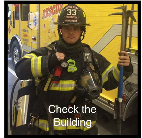
Check the Building

While the nozzle is a tool, the irons facilitate the forcible entry and can be left at the door for later use if needed